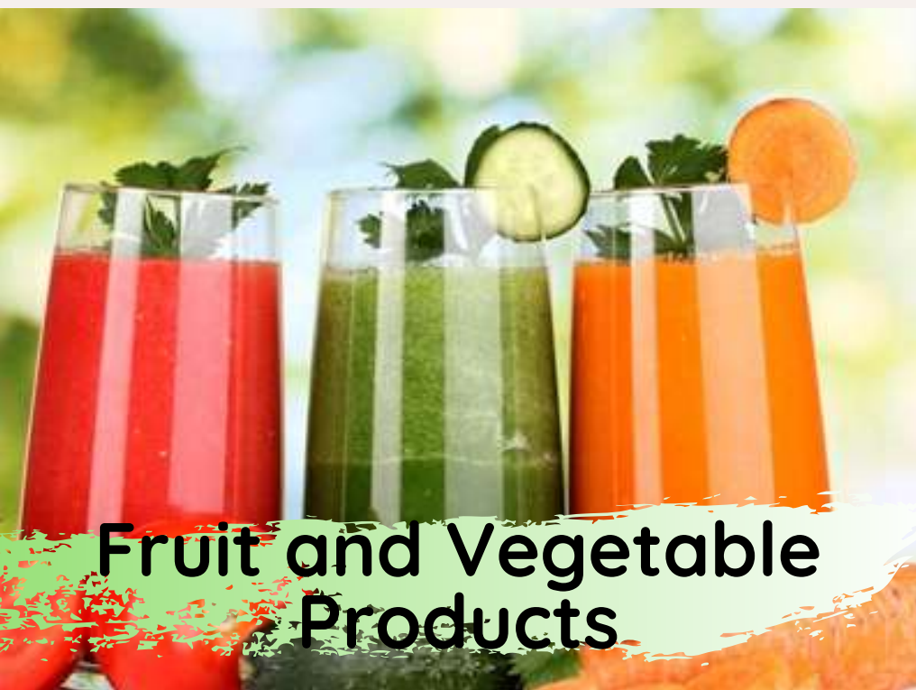
Fruit and Vegetable Products